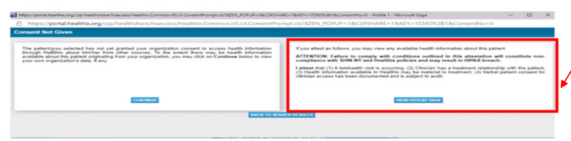
Figure 3. No consent on file. You will see this telehealth dialogue box.