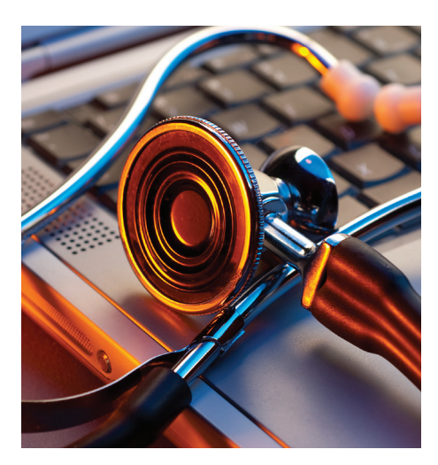
Our Shared Mission: To provide better care, improved outcomes, increased efficiencies, and improve member retention and satisfaction